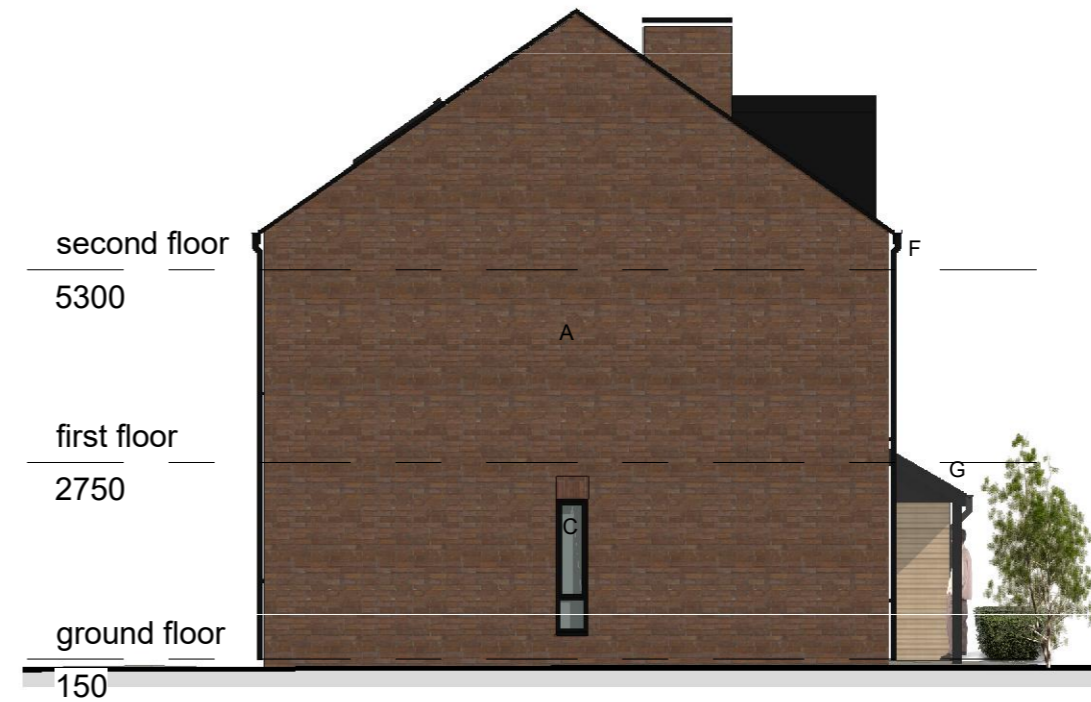
Side Elevation (left)